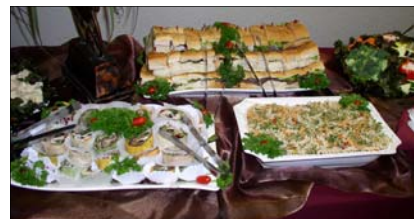
Mini Sandwiches, Wraps & Rotini Pasta Salad

Phone: 209-944-9601 www.mycountrycatering.com countrycatering@sbcglobal.net Fax: 209-464-8378 Commissary & Will Call: 2361 Waterloo Rd, Stockton Mailing: P.O. Box 8762, Stockton, CA 95208