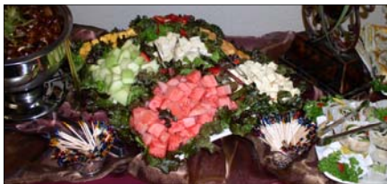
Fruit & Cheese